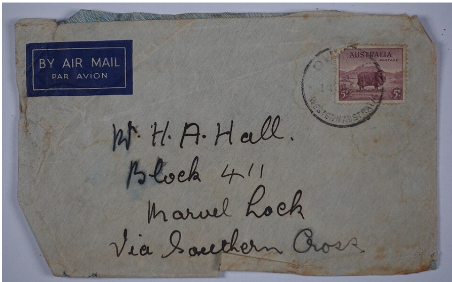
7: Item 245 – c.1940 To H A Hall, block 411, Marvel Loch (c. 1940)