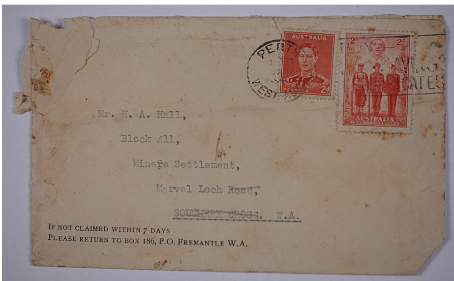
9: Item 244 – c.1940 Fremantle to H A Hall, block 411, Miners Settlement, Marvel Loch Road (c. 1940)